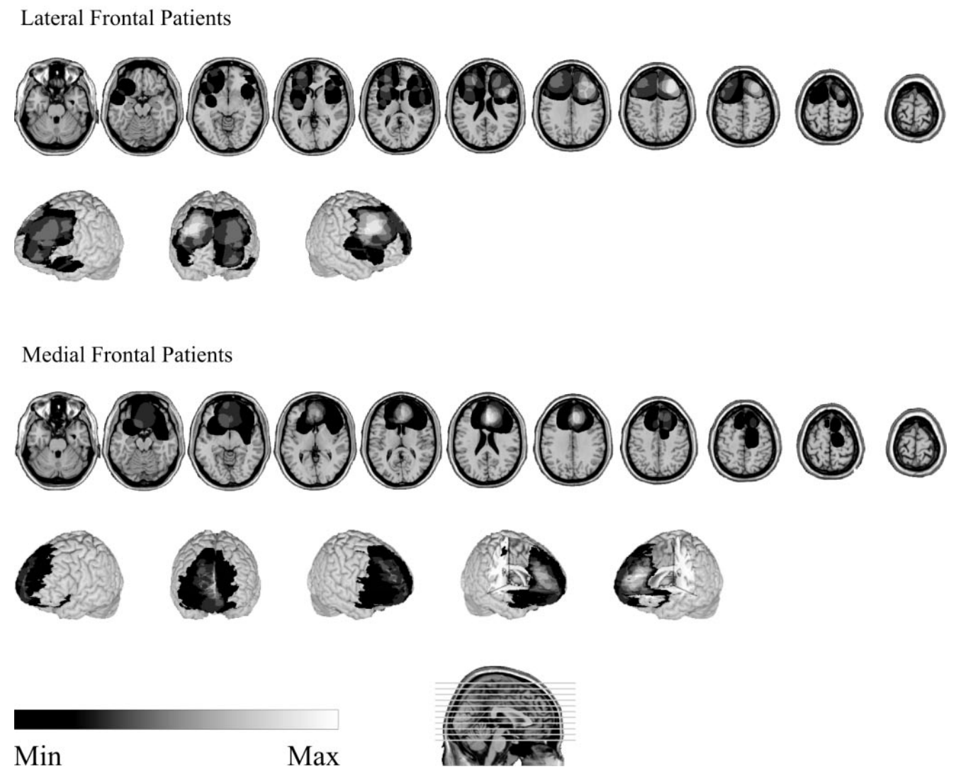
Fig. 1 Overlay lesion plots for the two lesion subgroups. The number of overlapping lesions in each voxel is illustrated on a grey scale: the lighter a voxel, the higher the number of patients with damage to that. The grey scale is devised so that voxels that were damaged with maximal frequency within a patient subgroup are shown in white. Thus, white areas were damaged in 6 out of 17 lateral frontal patients, and in 10 out of 18 medial frontal patients. Talairach z-coordinates (Talairach and Tournoux, 1988) of each transverse slice are 45, 55, 65, 75, 85, 95, 105, 115, 125, 135, 145.

LAT, lateral frontal; MED, medial frontal; CTL, control group.